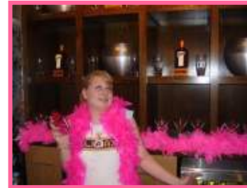
Long Cointreaupolitan launch at the Fusion & Foundry