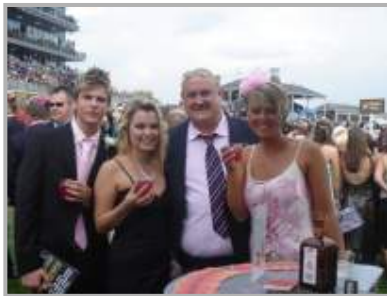
Doncaster Racecourse ladies day