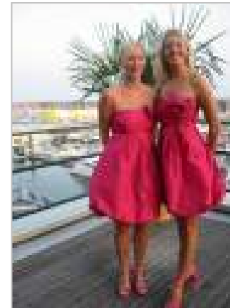
Blush Ball & Summer parties tastings (venues TBC)