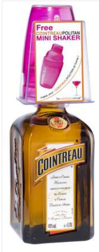
Cointreapolitan shaker on-pack promotion